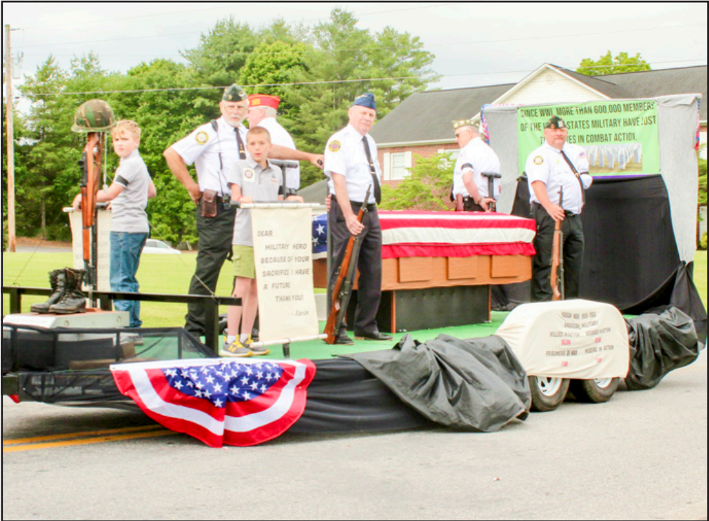
In Saturday’s parade, the North Georgia Honor Guard provided a compelling visual of a flag-draped coffin to showcase the reason behind Memorial Day.