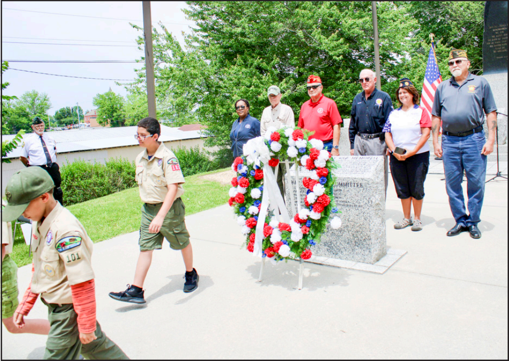
Local Boy Scouts honored the fallen by presenting the Memorial Wreath inside Union County War Memorial Park during the Memorial Day Service on Saturday.