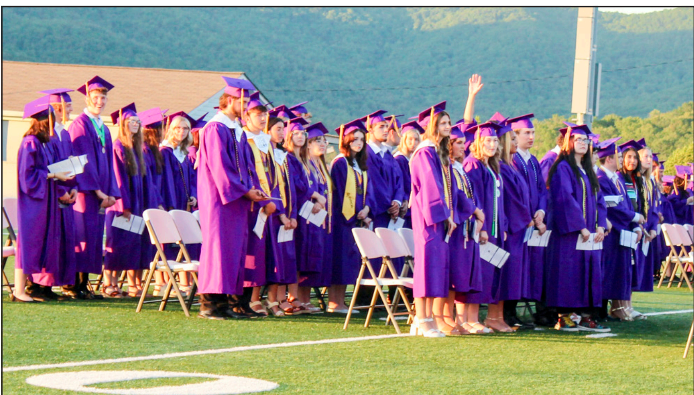
The UCHS Class of 2025 took part in the time-honored tradition of graduation on Friday, May 23.