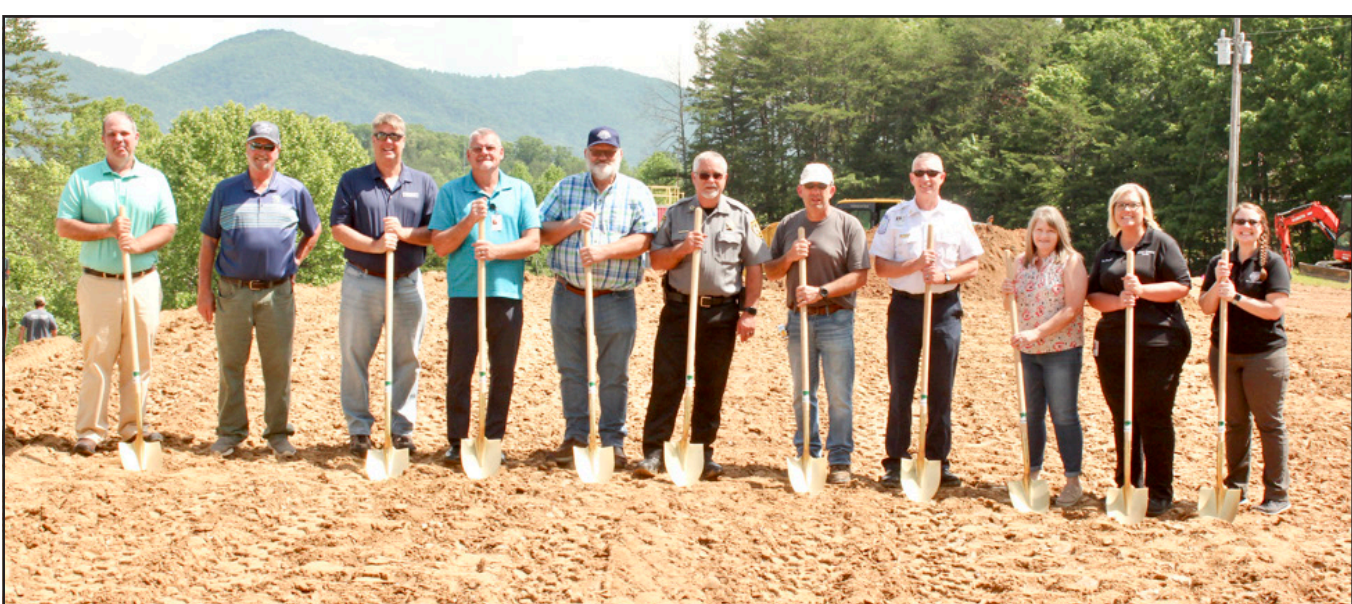
After years of planning, county officials are excited that the new E-911 Center has finally broken ground.

That's why the center is being built to accommodate growth, with the ability to add a fourth dispatcher on "active duty," upgraded technology,