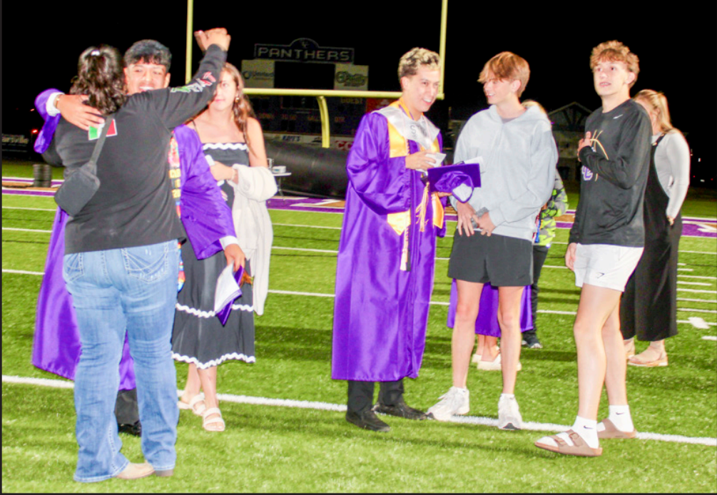
Families and friends were proud of their graduates on Friday, with everyone joining together in celebration after the Senior Class video and fireworks display.

Fireworks lit up the sky just before the audience was allowed on the field to embrace, high five, pose for pictures or exchange thanks and praise. From there, folks slowly began to filter out, but the fact remained that this year’s graduates have promising futures ahead of them.